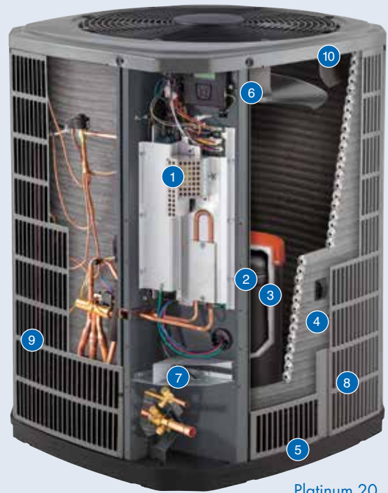
Platinum 20 Heat Pump shown

Features and components may vary by model and are shown for illustration purposes only. As part of our continuous product improvement, American Standard reserves the right to change specifications and design without notice.